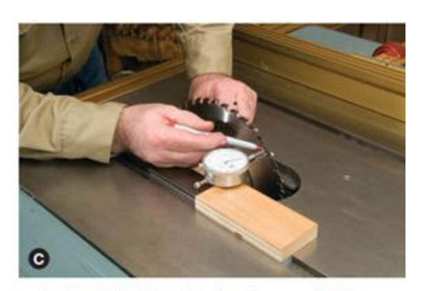
Check the blade's distance from the miter-gauge slot at two positions to make certain that it's parallel.

Making sure that the blade is perfectly parallel with the miter-gauge slot is an essential step when setting up a new saw. This step doesn't usually need revisiting with most stationary saws, but if you slide your saw around your shop, or toss it on your truck, it may need a tune-up. A fast and easy way to set the top is with a dial indicator (see the Buying Guide). To do this, screw the indicator's body to a block that fits snugly in the miter-gauge slot, as shown in Photo C. Position the tip of the indicator at a reference point on the blade near the front of the saw. Mark the location with a fine-tip marker, and turn the indicator's body to zero the