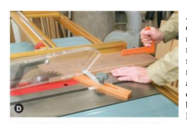
Featherboards and stock-pushing accessories promote safe woodworking procedures and also reduce edge burns.

As a rule, feed stock as quickly as your saw can comfortably handle. It's difficult to give precise recommendations on feed rate because there are so many variables, including blade style and sharpness, motor power and drive belt efficiency, not to mention stock thickness and density. Pay attention to the feed resistance, and listen to sound of your saw. Slow down as soon as you detect any bogging. Waxing your tabletop and fence can help. Reducing unnecessary friction will make it easier for you to maintain a uniform feed rate. A smooth top will also give you a better feel for how well the