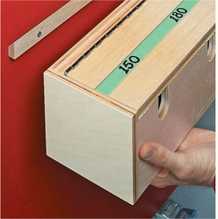
▲ A simple cleat allows you to hang the box in a convenient location, keeping sanding supplies close at hand.